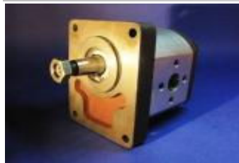
NEW HOLLAND 3630 Hidro Code: HI / NEH / 531 A