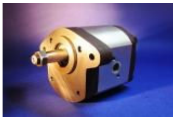
NEW HOLLAND 3220 Hidro Code: HI / NEH / 131