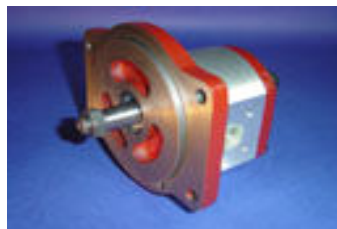
EICHER NC- 3 Cylinder Hidro Code: HI/EIC/115B