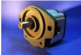
FLOW 12LPM @ 1500 RPM