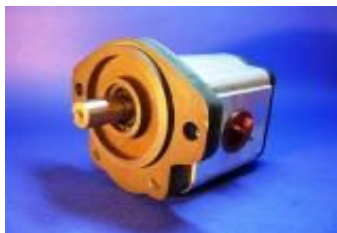
FLOW 25LPM @ 1500 RPM