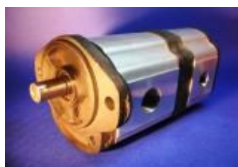
DOUBLE PUMP (HYDRAULIC CUM STEERING)