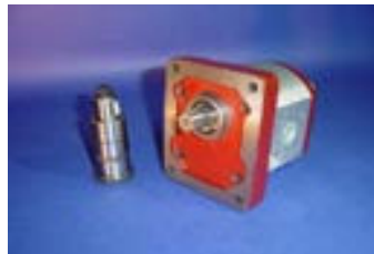
EICHER: with coupler O.E.M. Part No: 2060279 Hidro Code: HI/EIC/115A