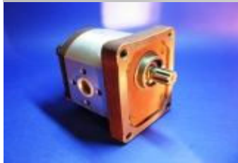
SAME GREAVES Hidro Code HI / SAM / 135