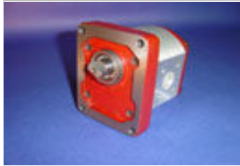
EICHER: OLD MODEL- PLASSEY TYPE O.E.M Part No: 1229308 / 1229235 Hidro Code: HI/EIC/114