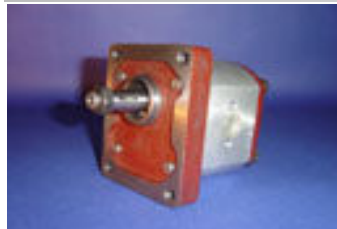
SARTAJ / SWARAJ 724 / 735/ ROMANIA-445 O.E.M Part No: P181000A/181000A Hidro Code: HI/SAR/108