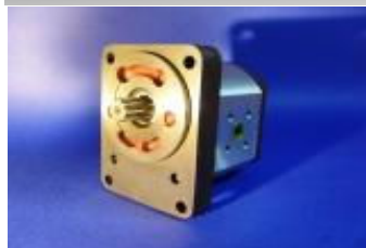
TEMPO BALWAN Hidro Code: HI / TEM / 130