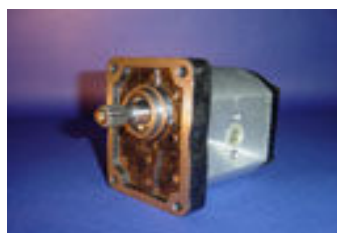
SWARAJ 735 / 855FE Hidro Code: HI/SAW/108B